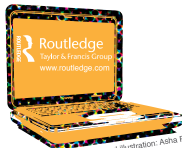
Cover design and illustration: Asha Pearse